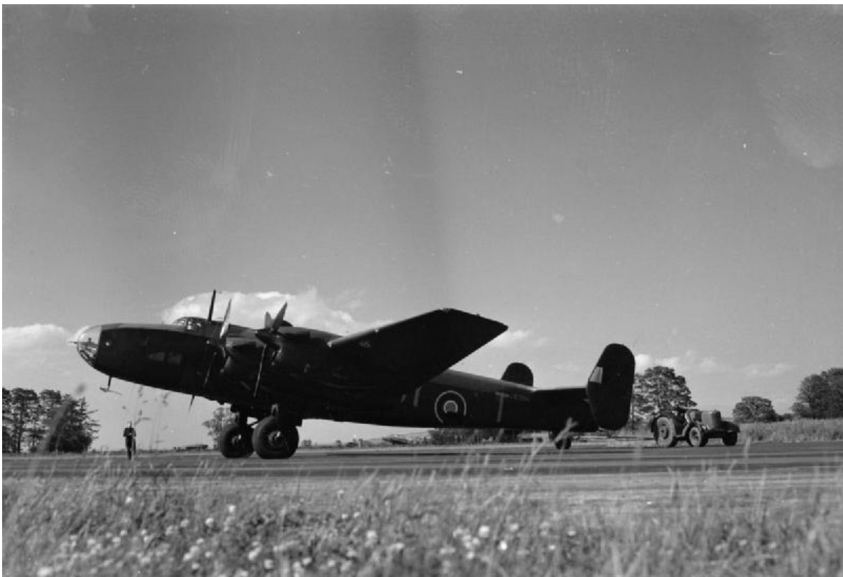
A Mk2 Halifax of 102 Squadron at Pocklington in 1942.