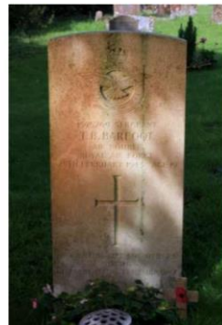
27 EE Tommy Barfoot